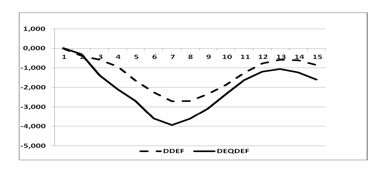
TABLE 7. Accumulated Impulse Response of Real GDP Growth

FIGURE 3. IRF's Accumulated Response of D(NGDP) from One Standard Deviation of (DEF) and D(EQDEF).